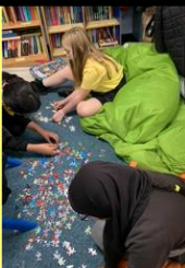
Disney Movie Time